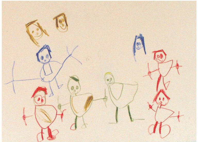
Isaac Obolensky Dell, Age 4